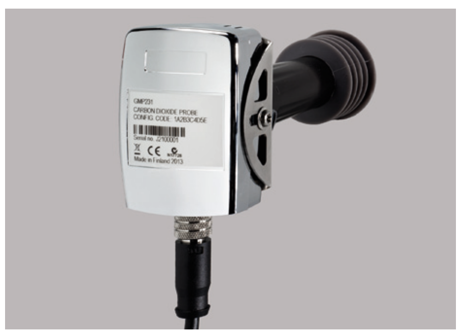
The Vaisala CARBOCAP® Carbon Dioxide Probe GMP231 withstands high temperature sterilization.

The Vaisala CARBOCAP® Carbon Dioxide Probe GMP231 is designed to provide incubator manufacturers with accurate and reliable carbon dioxide measurements and sterilization durability at high temperatures. The probe is based on Vaisala's patented CARBOCAP® technology and a new type of infrared (IR) light source. These technologies allow for sterilization temperatures of up to 180 °C, enabling easier and more complete sterilization without the risk of cross contamination.