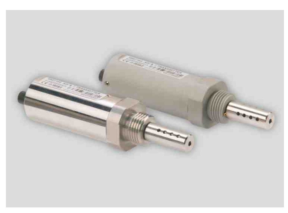
The MMT162 enables on-line moisture monitoring in oils even in the most demanding applications.